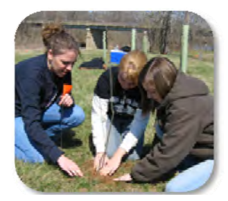
Youth Planting Projects