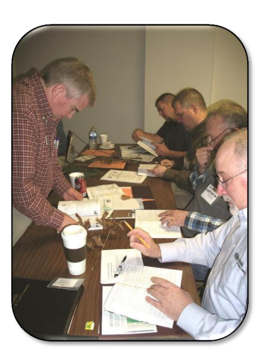
Participants in the Real Forestry for Real Estate class in Abingdon learn how to identify trees using a key.

The Virginia Forest Landowner Education Program received a second Education Grant from the American Tree Farm System for 2013 to expand the award-winning Real Forestry for Real Estate (RFRE) program. This program puts sustainable forest management information in the hands of new forest landowners through partnerships with real estate professionals. The 2013 grant will be used to continue to offer "Real Forestry for Real Estate" continuing education classes (10 in 2013), as well as to develop a field-based program on timber valuation (as requested by previous class participants). Four timber valuation classes will be offered.