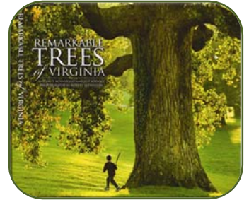
Remarkable Trees of Virginia will soon go into its second printing