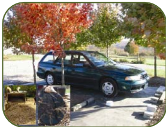
Virginia Tech's Mini Parking Lot—a demonstration site at the Urban Horticulture Center