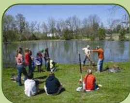
Arbor Day Tree Planting with the Urban Forestry Club