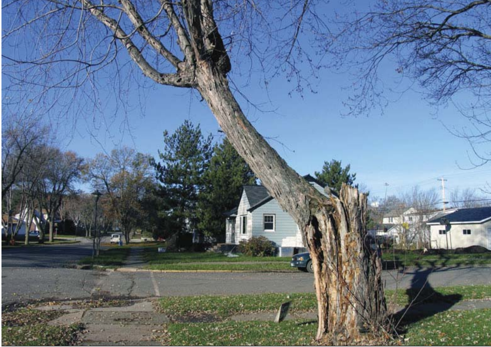
This decaying silver maple could collapse at any moment.

defensible objective for the specification that we are writing. The objective of the assessment, as stated in the Standard, shall be based on three things: the context in which we find the tree, the intended use of the site on which the tree resides, and the scope of our assignment.