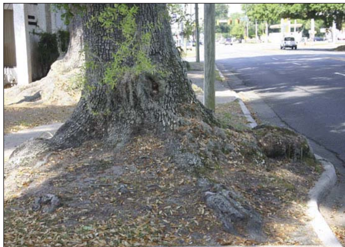
Not even a reconstructed curb can keep this live oak's enormous root system contained.

Level One is the most basic inspection level, a limited visual assessment of an individual tree or a population of trees near specified targets. This is what we call the classic "windshield survey." Level one may be appropriate in the municipal context or for a homeowners association where there are relatively large populations of trees under moderate management intensity. We might choose to drive along a