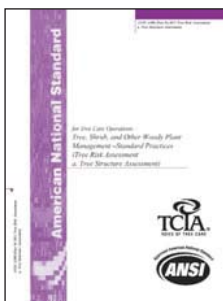
ANSI Part 9

Another factor that might contribute to elevated tree hazards and failures in the near future is the recession of our economy, particularly when it comes to publicly owned trees. Tree maintenance has been commonly deferred over the last few years, and both municipalities and private land owners may not be providing the same level of tree care, in general, compared to pre-recession years. In some cities such as San Francisco, municipalities are actually transferring maintenance of street trees to