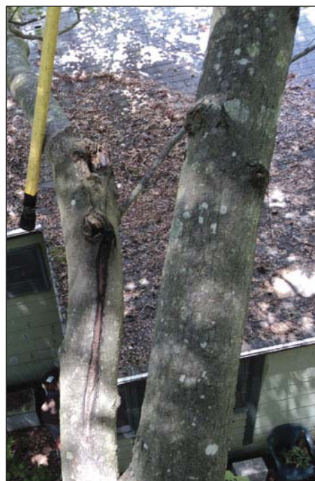
A visual inspection easily spots this dangerous branch that is about ready to fall on to this roof.