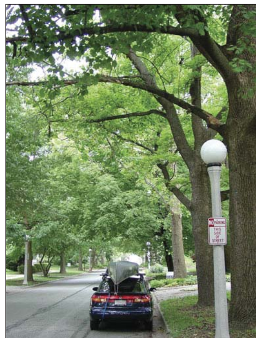
These overhead dead branches are just waiting to crash down.

adjacent property owners. Some people are going to take that mandate very seriously and provide an appropriate level of care because they value their trees and they understand the consequences of neglected trees. But undoubtedly there are going to be a lot of trees that do not receive preventive maintenance. As the economy recovers, tree care will surely follow suit, but what opportunities have we missed to eliminate minor defects in juvenile trees that may prove problematic in the future?