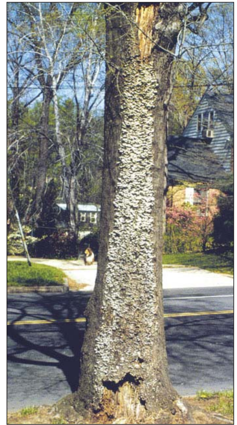
Neglected decaying and covered in fungi, this tree is an accident just waiting to happen.

"Mitigation" is a term that I see commonly used inappropriately. In the Standard, it is very clearly defined as the process of diminishing risk. We do not eliminate risk in trees when we perform some form of mitigation practice. We are minimizing the risk to some acceptable level, which should always be a determination by the tree owner, not the arborist. Be very careful how you use that term mitigation when you are writing a specification or a subsequent recommendation.