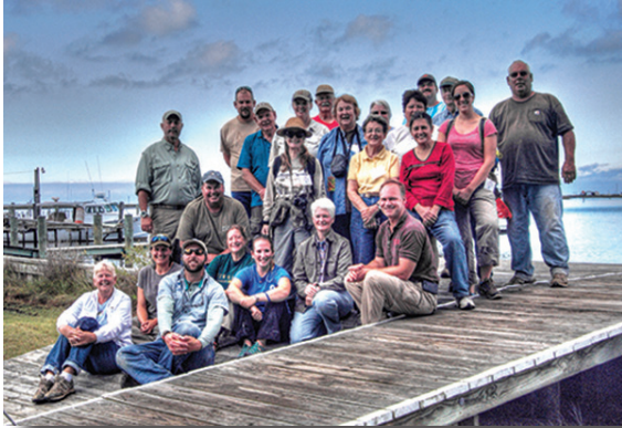
Group shot on the dock at Smith Island before returning to dry land.