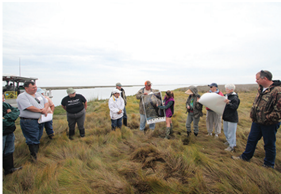
Mucking around and learning about the importance of these grass islands to Bay health.

The Virginia Forest Landowner Education Program and Virginia Cooperative Extension teamed up with the Virginia Department of Forestry, the Alliance for the Chesapeake Bay, and the Chesapeake Bay Foundation (CBF) to offer the first-ever Forestry across the Bay Bus and Boat Tour in September. This 2-day experience was part of the long-running Fall Forestry & Wildlife Field Tour Series.